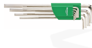
96432100 Hex L-Key set