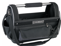
81620004 Tool bag