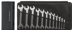
96400307 Double open-ended wrench set