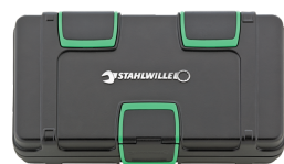
81251019 Tool case