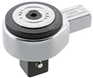
58250040 Fine-tooth ratchet insert tool