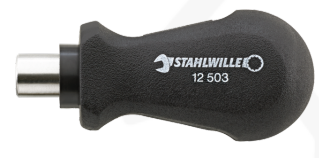
18110016 Bit holder