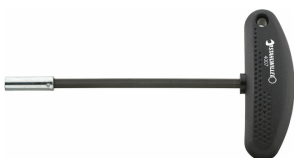
18090016 Bit screwdriver