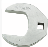
02501048 Crowfoot spanner heavy-duty