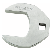
02501052 Crowfoot spanner heavy-duty