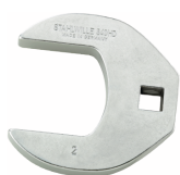
02501028 Crowfoot spanner heavy-duty