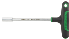
18093016 Bit holder