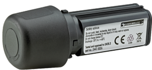
54101195 Li-Ion battery