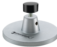
52110162 Support for docking station No. 7762