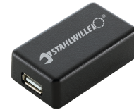
52110061 Interface adaptor