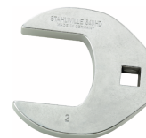
03501072 Crowfoot spanner heavy-duty