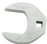
03501064 Crowfoot spanner heavy-duty