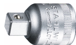
13030002 Square drive adaptor