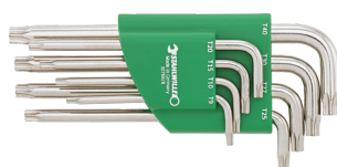
96432200 TORX® L-Key set