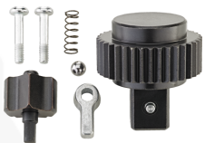
19050000 Ratchet spare parts set