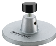
52110162 Support for docking station No. 7762