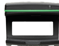
52110220 Bluetooth Low Energy module