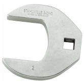
02501024 Crowfoot spanner heavy-duty