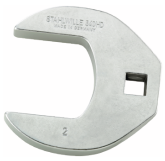
02501036 Crowfoot spanner heavy-duty