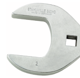
02501042 Crowfoot spanner heavy-duty