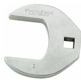
02501028 Crowfoot spanner heavy-duty