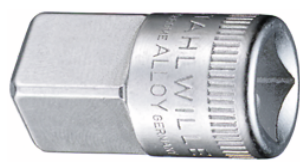
12030003 Square drive adaptor