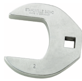
02501038 Crowfoot spanner heavy-duty