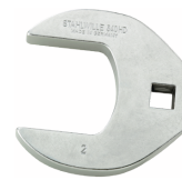
02501034 Crowfoot spanner heavy-duty