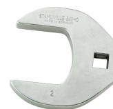
02501062 Crowfoot spanner heavy-duty