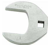
02501044 Crowfoot spanner heavy-duty