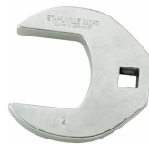
02501052 Crowfoot spanner heavy-duty