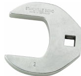
02501046 Crowfoot spanner heavy-duty