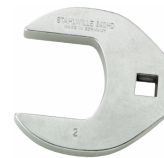
02501054 Crowfoot spanner heavy-duty