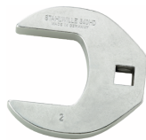
02501050 Crowfoot spanner heavy-duty