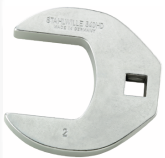
02501048 Crowfoot spanner heavy-duty