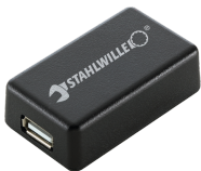
52110061 Interface adaptor