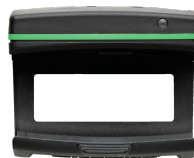
52110220 Bluetooth Low Energy module