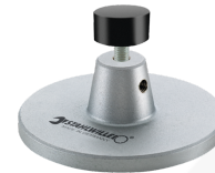
52110162 Support for docking station No. 7762