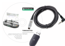
96583631 USB adaptor, jack- push/pull cable and TorkMaster software