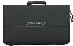
81230103 Textile bag