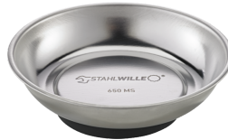
90432779 Magnetic tray