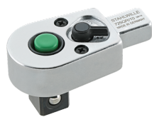
58253004 QuickRelease ratchet insert tool