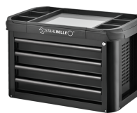
81200157 Tool chest