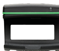
52110220 Bluetooth Low Energy module