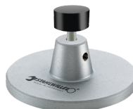
52110162 Support for docking station No. 7762