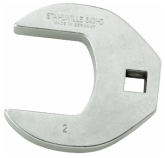
03501064 Crowfoot spanner heavy-duty