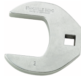
03501069 Crowfoot spanner heavy-duty