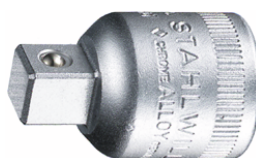
13030002 Square drive adaptor