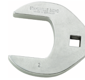
03501072 Crowfoot spanner heavy-duty