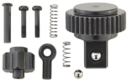
19040030 Ratchet spare parts set