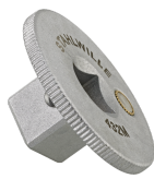
12030010 Square drive adaptor