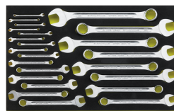
96830885 Combination spanner set