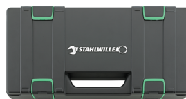
81271013 Tool case