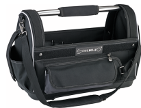
81620004 Tool bag