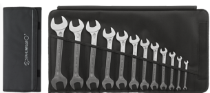
96400307 Double open-ended spanner set