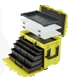
96132175 Tool trolley