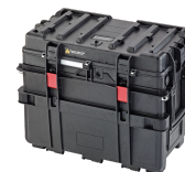
81091322 Tool trolley