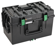
81091337 Top case 13262 TS