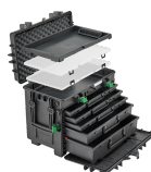
81091306 Tool trolley