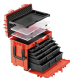
81091304 Tool trolley