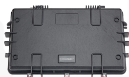
90432682 Spare parts