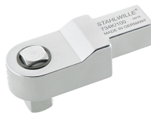
58243012 Calibration square drive insert tool