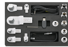
96585224 Calibration accessory set