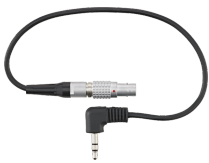
52110058 Jack-push/pull cable, short