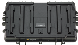
90432907 Trolley lid