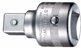
16030005 Square drive adaptor