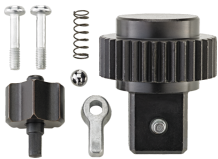
19070000 Ratchet spare parts set