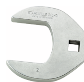
03501069 Crowfoot spanner heavy-duty