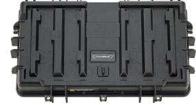
90432907 Trolley lid