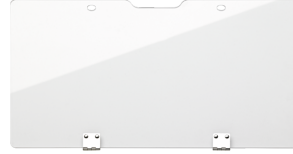
89010100 Transparent cover