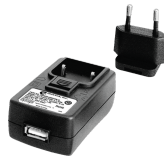
52110063 USB power supply