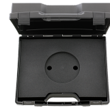
81500004 Plastic box, empty