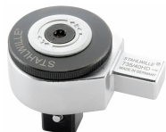
58250065 Fine-tooth ratchet insert tool