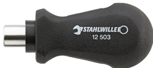
18110016 Bit holder