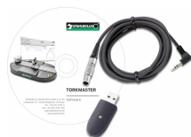
96583631 USB adaptor, jack- push/pull cable and TorkMaster software