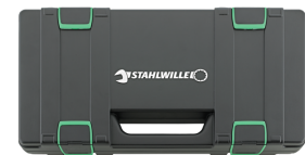
81271013 Tool case