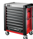
81200168 Tool trolley