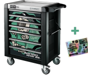
81200175 Tool trolley special edition Best tools never die