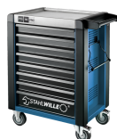
81200167 Tool trolley