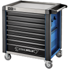
81200173 Tool trolley