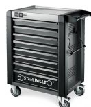
81200166 Tool trolley