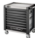
81200172 Tool trolley