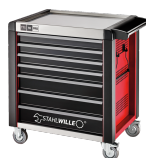
81200171 Tool trolley