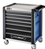
81200170 Tool trolley