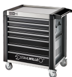
81200169 Tool trolley