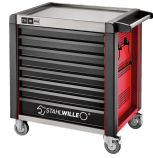
81200174 Tool trolley