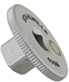
11030010 Square drive adaptor