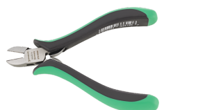
67076000 Electronics side cutter