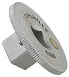
12030010 Square drive adaptor