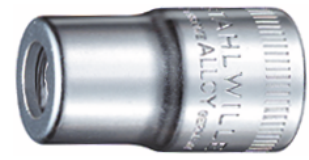
12180030 Bit holder