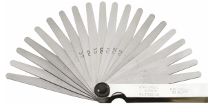
74240002 Precision feeler gauge