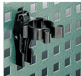
80360012 Spring clip