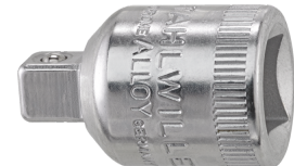
12030001 Square drive adaptor