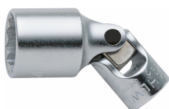
01140008 Uniflex sockets