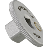
11030010 Square drive adaptor