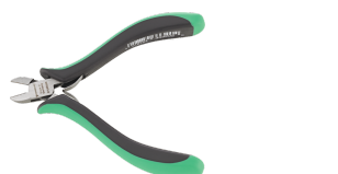
67086000 Mini electronics side cutter