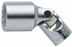
01140008 Uniflex sockets