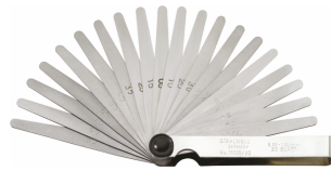
74240002 Precision feeler gauge