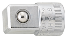
11030003 Square drive adaptor