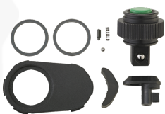
19012020 Ratchet spare parts set