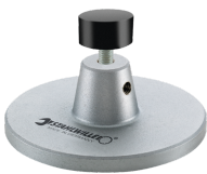
52110162 Support for docking station No. 7762