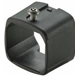
54100070 QuickRelease safety locks