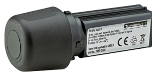
54101195 Li-Ion battery