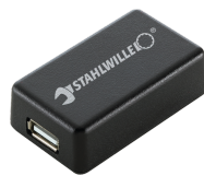
52110061 Interface adaptor