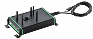
52110062 Docking station for No.714