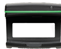
52110220 Bluetooth Low Energy module