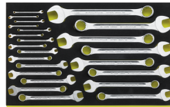
96830885 Combination spanner set