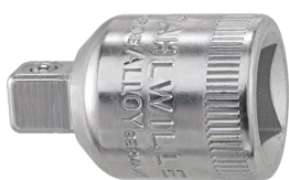
12030001 Square drive adaptor