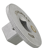
12030010 Square drive adaptor