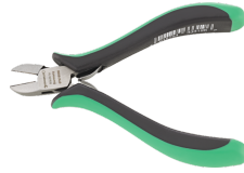
67076000 Electronics side cutter