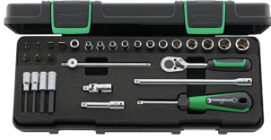
96011134 Socket set