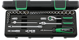
96010107 QuickRelease socket set