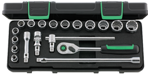
96021180 Socket set