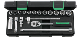
96021234 Socket spanner set