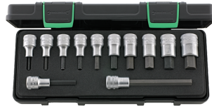
96031503 INHEX screwdriver socket set