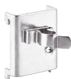
81485006 Spring clip