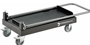
81091009 Tool box trolley