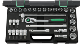
96031440 Socket set