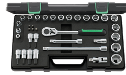
91332159 Socket spanner set