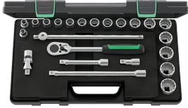
96035125 Socket set