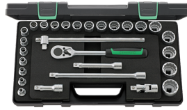
96031407 Socket set