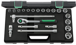
96031480 Socket set