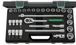
96031439 Socket set