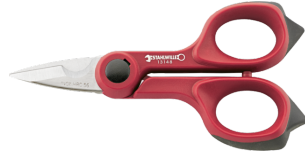
75270003 Wire cutters