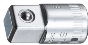
11030002 Square drive adaptor