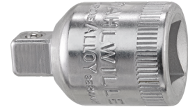
12030001 Square drive adaptor