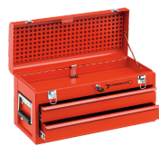
81091002 Tool box