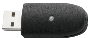
52111057 USB adaptor