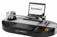
52111192 Calibration system