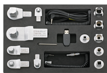
96585224 Calibration accessory set