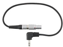
52110058 Jack-push/pull cable, short