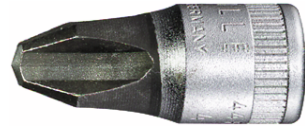
01290003 Screwdriver socket