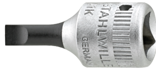
01280010 Screwdriver socket