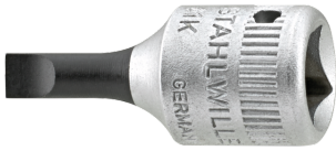
01280006 Screwdriver socket