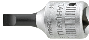
01280012 Screwdriver socket