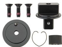
59251065 Set of spare parts