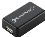
52110061 Interface adaptor