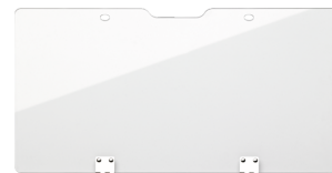
89010100 Transparent cover